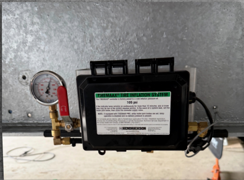
Tire Inflation System