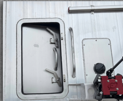
Front access door