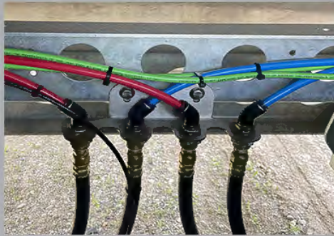
Simple hose routing