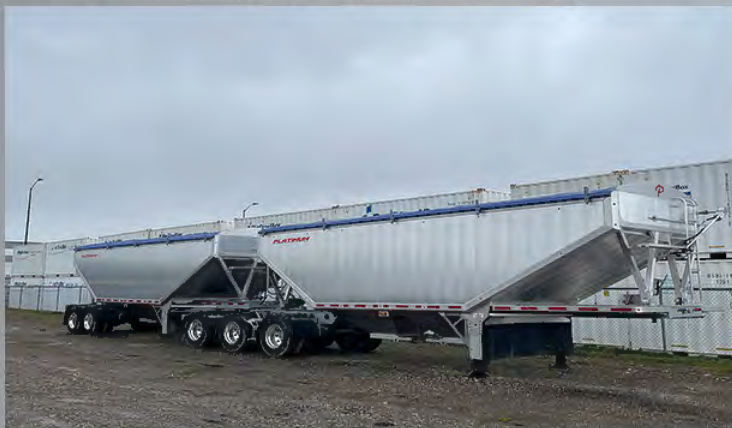
Custom height/length/slope angles