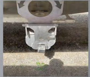
Innovative chute lock