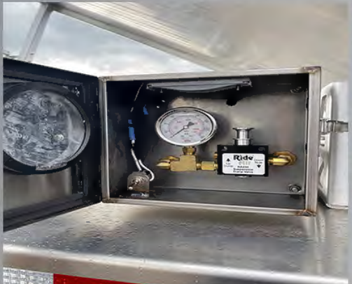
Air ride control box