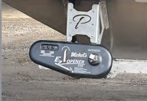
Electric chute openers