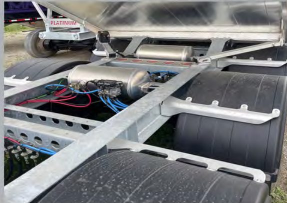
Aluminum air tanks